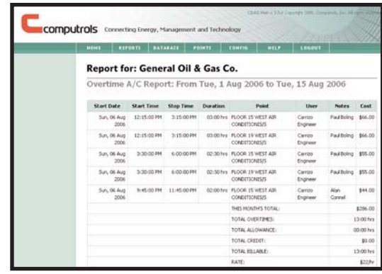
Produce reports of usage for select tenants or all groups.

To ensure secure record keeping, all invoice adjustments, invoices, and invoicing histories are retained throughout the lifetime of CBAS-Web.